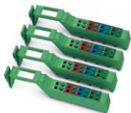
Connector set, for IB IL DI/DO 8, copper, with color print.

Please be informed that the data shown in this PDF Document is generated from our Online Catalog. Please find the complete data in the user's documentation. Our General Terms of Use for Downloads are valid ( http://phoenixcontact.com/download )