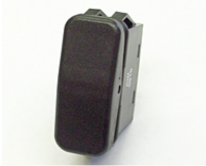
Item # GRB258101BB, GRB Series Full Size Sealed Rocker Switches

Email: info@cwind.com • Website: http://www.cwind.com