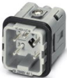
Contact insert, number of positions: 4+PE, size: D7, number of connections per position: 1, Pin, Screw connection, 230/400 V, 24 A, 0.5 mm 2 ... 2.5 mm 2

Please be informed that the data shown in this PDF Document is generated from our Online Catalog. Please find the complete data in the user's documentation. Our General Terms of Use for Downloads are valid ( http://phoenixcontact.com/download )