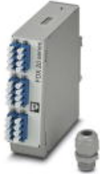
DIN rail splice box, fully mounted ready to splice, for 12x LC duplex (OS2)

Please be informed that the data shown in this PDF Document is generated from our Online Catalog. Please find the complete data in the user's documentation. Our General Terms of Use for Downloads are valid ( http://phoenixcontact.com/download )