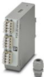
DIN rail splice box, fully mounted ready to splice, for 12x LC duplex (OM4)

Please be informed that the data shown in this PDF Document is generated from our Online Catalog. Please find the complete data in the user's documentation. Our General Terms of Use for Downloads are valid ( http://phoenixcontact.com/download )