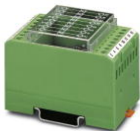
Diode module, with 8 diodes, individually wired, diode type 1N 4007

Please be informed that the data shown in this PDF Document is generated from our Online Catalog. Please find the complete data in the user's documentation. Our General Terms of Use for Downloads are valid ( http://phoenixcontact.com/download )