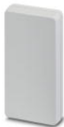
Handheld housing, C-Medium, light gray, front level closed, consisting of two half shells with screws

Please be informed that the data shown in this PDF Document is generated from our Online Catalog. Please find the complete data in the user's documentation. Our General Terms of Use for Downloads are valid ( http://phoenixcontact.com/download )