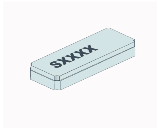
Outline (mm) -SM1 = Gold Plated (lead free) glass lid