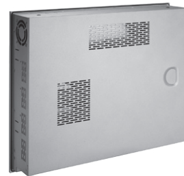
▲ Less screw design