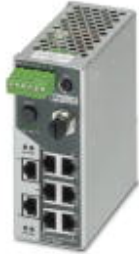
Smart Managed Narrow Switch (SMN) with eight 10/100 Mbps RJ45 ports, PROFINET mode (default)

Please be informed that the data shown in this PDF Document is generated from our Online Catalog. Please find the complete data in the user's documentation. Our General Terms of Use for Downloads are valid ( http://phoenixcontact.com/download )