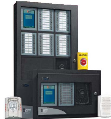
E3 Series Combined Fire and MNS System