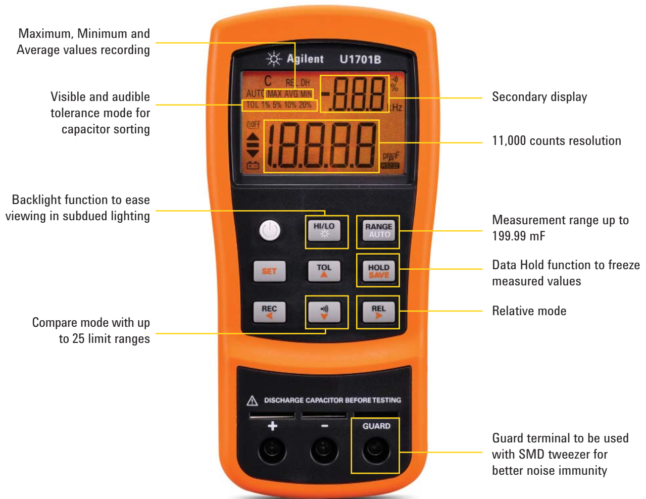
Figure 2. U1701B front view