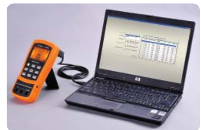
Figure 1. Automate the recording of continuous readings when you hook the U1701B to a PC

The handheld capacitance meter comes in a robust overmold and tested to stringent industrial standards. Each capacitance meter is also sealed with a three-year warranty and the assurance that you can test your components with confidence.