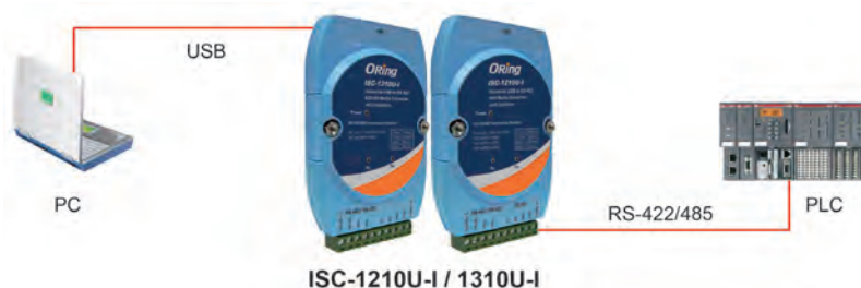
Connections of USB to Serial Media Converter

The ISC-1210U-I / ISC-1310U-I converter is an intelligent, stackable expansion module that connects to a PC USB port or USB Hub via the Universal Serial Bus(USB) port, providing one High-Speed RS-232/RS-422 or RS-485 serial port(jumper-less). The ISC-1210U-I / ISC-1310U-I features easy connectivity for traditional serial devices. The RS-232 standard supports full-duplex communication and handshaking signals (such as RTS, CTS) and the RS-485 control is completely transparent to the user and software written for half-duplex operation without any modification. The ISC-1210U-I / ISC-1310U-I's opto-isolators provide 3000 VDC of isolation to protect the host computer from destructive voltage spikes on the RS-232/RS-422 and RS-485 data lines. ISC-1210U-I / ISC-1310U-I also offer internal surge-protection on data lines. The internal high-speed transient suppressors on each data line protect the modules from dangerous voltages levels or spikes. In addition, the ISC-1210U-I / ISC-1310U-I module derives the power from USB port and doesn't need any aid of external power adapter.