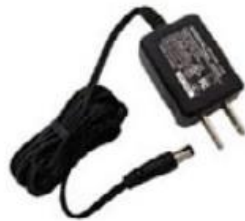
2: AC/DC Power Adapter