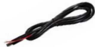
3: Hardwire DC Power Cable