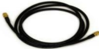
5: SMA-to-SMA Device Cable – If connecting to an SMA device