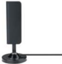
4: Magnetic-Mount Outdoor Signal Antenna MB.TG30.A.305111