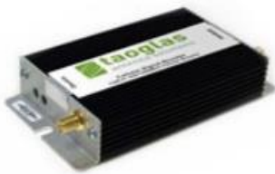
1: CSB.01 Amplifier Unit