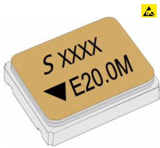
Outline (mm) -A-SM1 = 5000G, Gold plated (lead free)

■ Maximum Process Temperature: 260°C for 20 seconds max