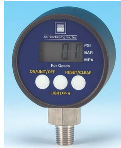
MediaGauge™ Model MGA-9V with rubber boot option