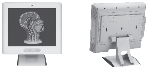
▲ Stand kit