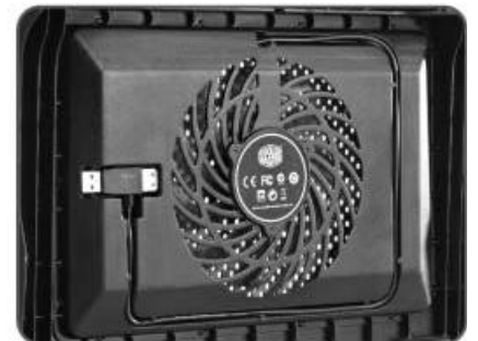
Easy Cable Management

Note: Photos may differ slightly from the final product.