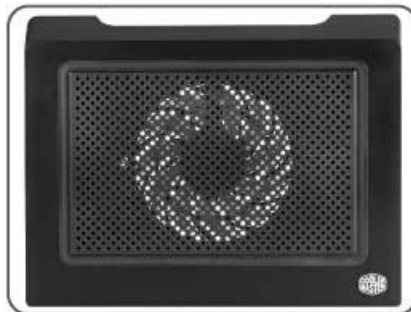
140 mm Silent Fan