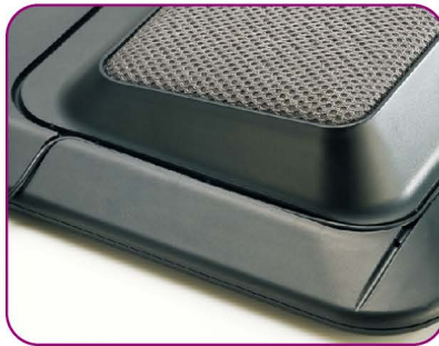
Cable Management Grooves