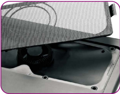
Quick Release Fan Cover