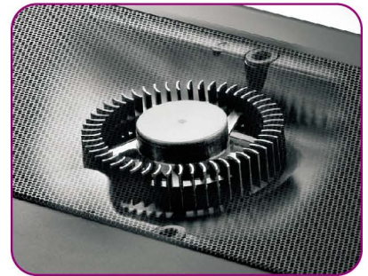
80 mm silent blower fan