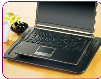
Works well on desks and tables