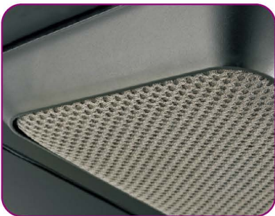
Comfortable Bottom Mat