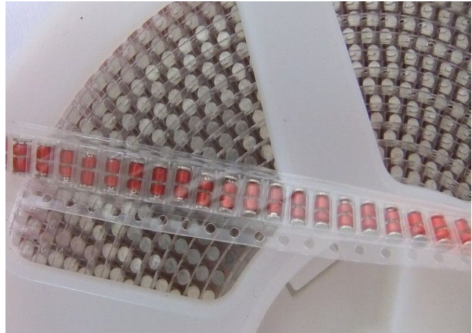
HAB Series Photo