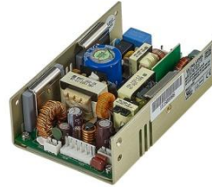
U Type (U-Chassis only): 3.2(W) x 5(L) x 1.5(H) inches.