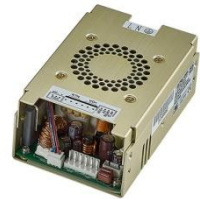
F Type (U-Chassis with top built-in fan): 3.2(W) x 5(L) x 2(H) inches.