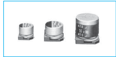
Marking color : Black print (except height : 10mm) White print on a brown sleeve ( \phi 8 \times 10L, \phi 10 \times 10L )