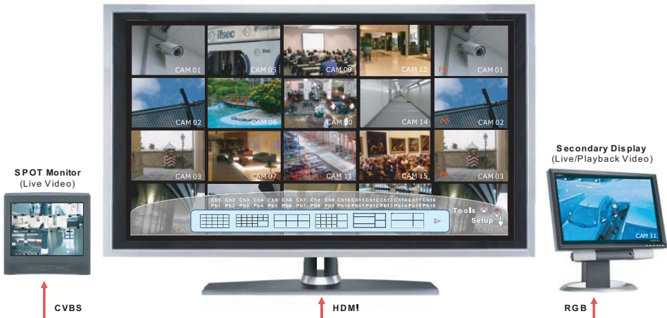
Advanced 16 - Channel DVR System