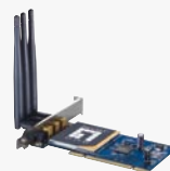
WNC-0600 300Mbps Wireless PCI Card