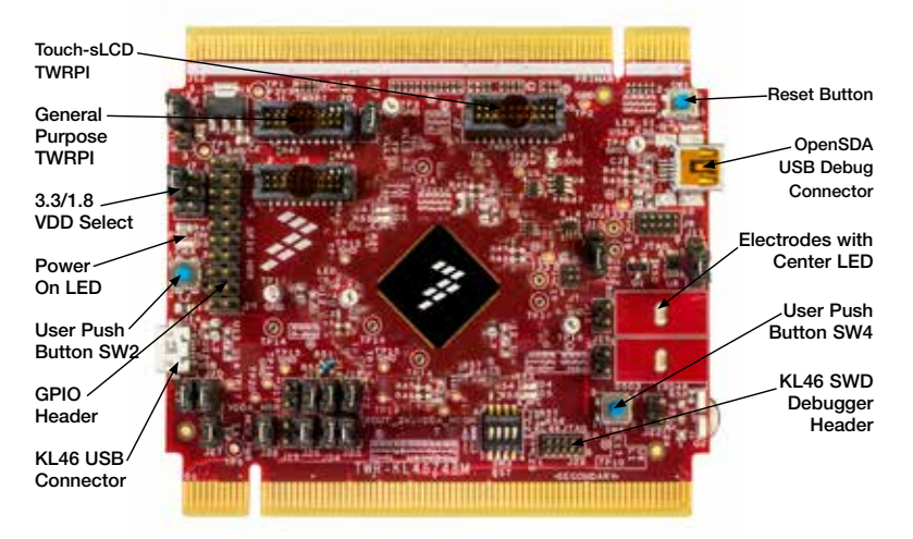
Figure 1: Front side of TWR-KL46Z48M module (TWRPI device not attached)