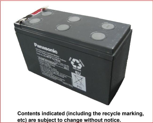
Contents indicated (including the recycle marking, etc) are subject to change without notice.

For pitch backup systems in wind turbines Expected life: 10 years at 20°C, 5 years at 25°C (based on a weekly discharge cycle of max 15 seconds)