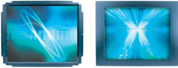
Open Frame Type