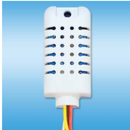
Capacitive humidity sensor --Voltage output, Model: MM2001/MMT2001