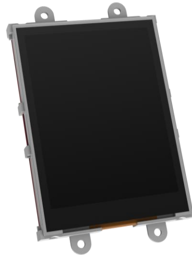
The uLCD-28-PTU Display Module