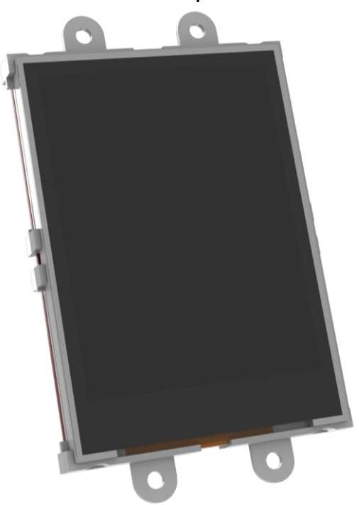
The uLCD-24-PTU Display Module