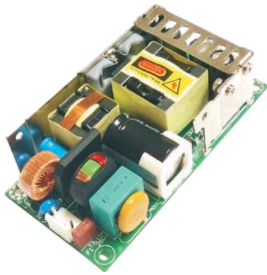
Size: 4.00 x 2.00 x 1.09 inches Weight: 6.3~8.8oz (180~250g)