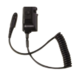
Ear Mic VOX/PPT Interface Module