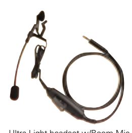
Ultra-Light headset w/Boom Mic and in-line PTT