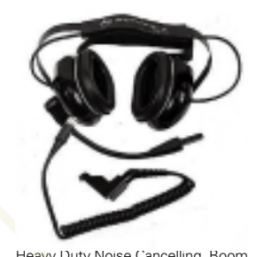
Heavy Duty Noise Cancelling Boom Mic w/ PTT Earcup