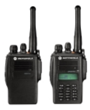
IP67 Rated and FM Approved GP628 Plus and GP638 Plus

Factory Mutual Approval The GP628 Plus and GP638 Plus radio units are certified by Factory Mutual Approvals as intrinsically safe for use in Division 1, Class I, II, III, Groups C,D,E,F,G and Division 2, Class I, Groups A,B,C,D, when ordered with the Factory Mutual approved battery option.