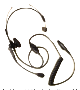
Lightweight Headset w/Boom Mic and in-line PTT