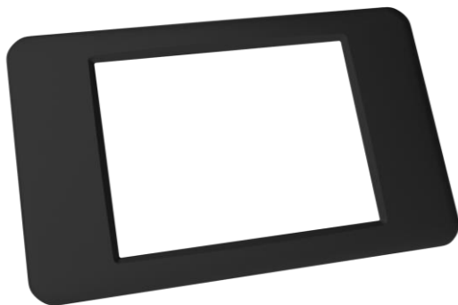
Bare 3.2" Bezel - Front