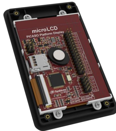
uLCD-32PTU Mounted in 3.2" Bezel - Back