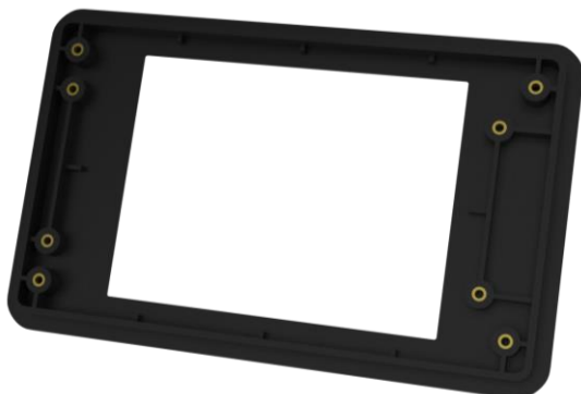
Bare 3.2" Bezel - Back