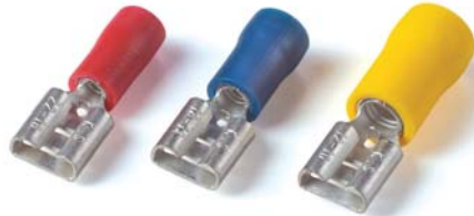
250 Tab Size