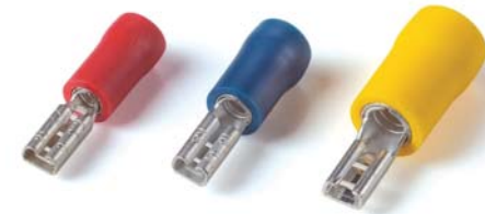
110 Tab Size