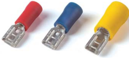
187 Tab Size