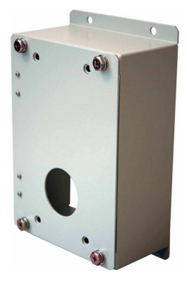
CAS-3281 Wall Box Mount Kit