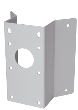
CAS-3222 Plate Corner Mount Kit