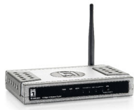
WBR-6003 150Mbps Wireless Router