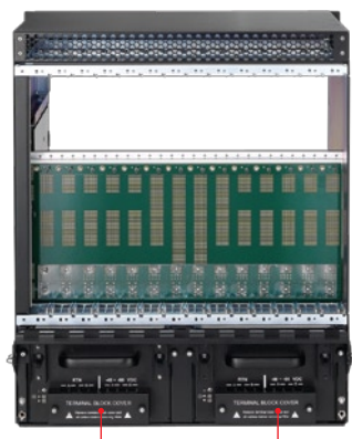
Rear View Power Entry Module (PEM)