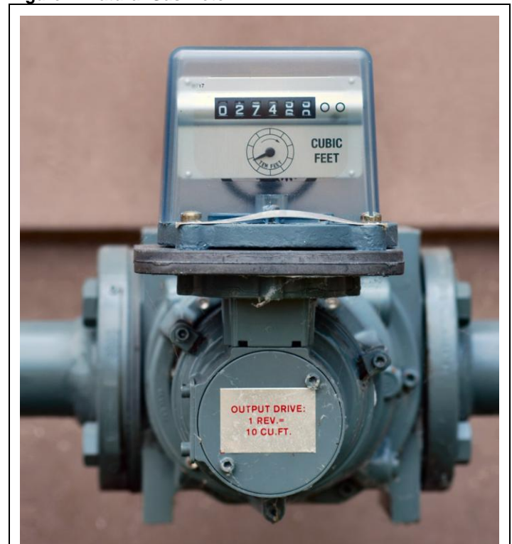
Figure 2. Natural Gas Meter

Install linear Hall-effect sensors in multiple locations inside the meter to detect the abnormal presence of a magnetic field. Send an alarm to the utility company or record this fraudulent activity in memory for processing at a later date.