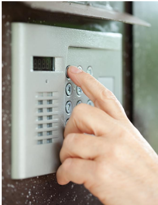
Figure 3. Electronic Locks

Without reproducing the exact magnetic flux pattern, it would be virtually impossible to unlock the system with a single, or even multiple, strong magnets. Tiny Honeywell SS39ET Surface-Mount Linear Hall-effect Sensor ICs would provide the needed sensitivity, output and very small size.