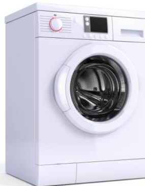
Figure 4. Washing Machine

A linear Hall-effect sensor generates an enhanced control signal for better resolution of the rotor position, which can improve the motor's efficiency.