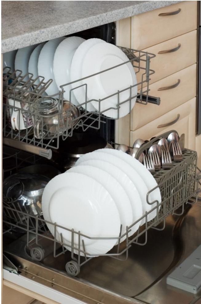
Figure 6. Dishwasher

SS39ET/SS49E/SS59ET Series sensors can monitor the current powering the electromagnets in the pump's motor. If the current is not within its normal range, the logic could also perform overload or motor malfunction detection.