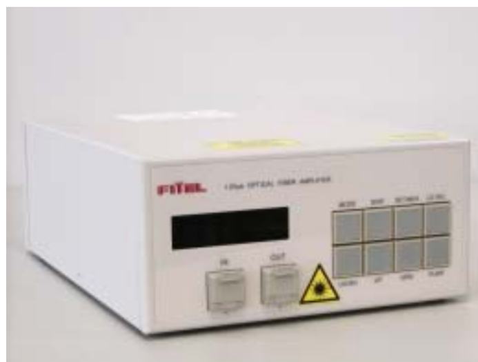
Appearance of ErFA11022