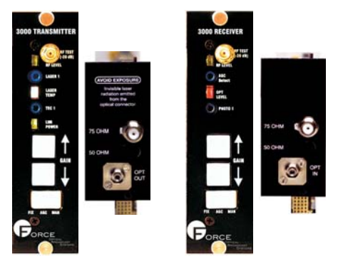
Transmitter and Receiver Front and Rear Views