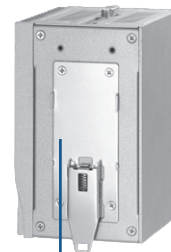
Din-rail kit ▲ Rear view