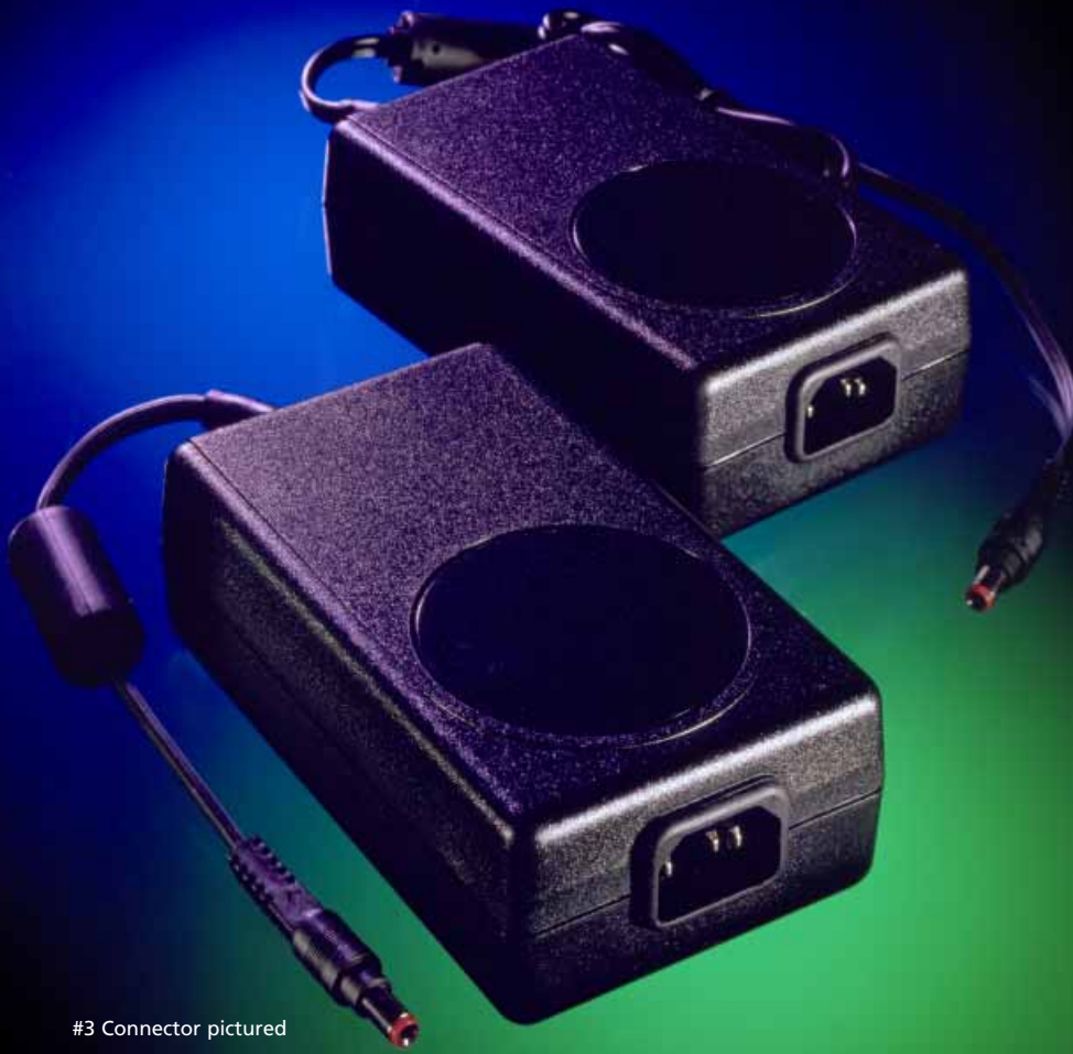
#3 Connector pictured