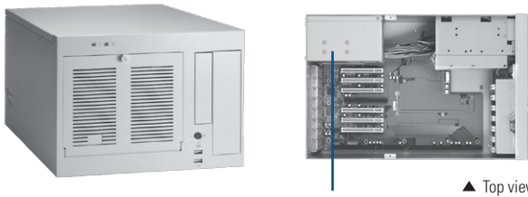
▲ Top view

Equipped with a power supply bracket securing the power supply better when the chassis is positioned in 90° orientation