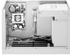
▲ Interior view