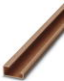
G-profile DIN rail, material: Copper, unperforated, height 15 mm, width 32 mm, length 2 m

DIN rail - NS 32 CU/35QMM UNPERF 2000MM - 1201358