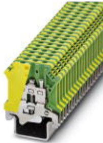
Ground modular terminal block, Connection method: Screw connection, Cross section: 0.2 mm 2 - 4 mm 2 , AWG 24 - 12, Width: 6.2 mm, Color: green-yellow, Mounting type: NS 35/15-2,3

Please be informed that the data shown in this PDF Document is generated from our Online Catalog. Please find the complete data in the user's documentation. Our General Terms of Use for Downloads are valid ( http://download.phoenixcontact.com )