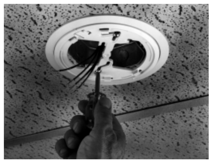
Figure 1. Install adapter bracket between ceiling and mounting bracket.