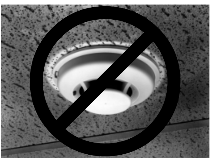
Figure 4. Detector without adapter bracket