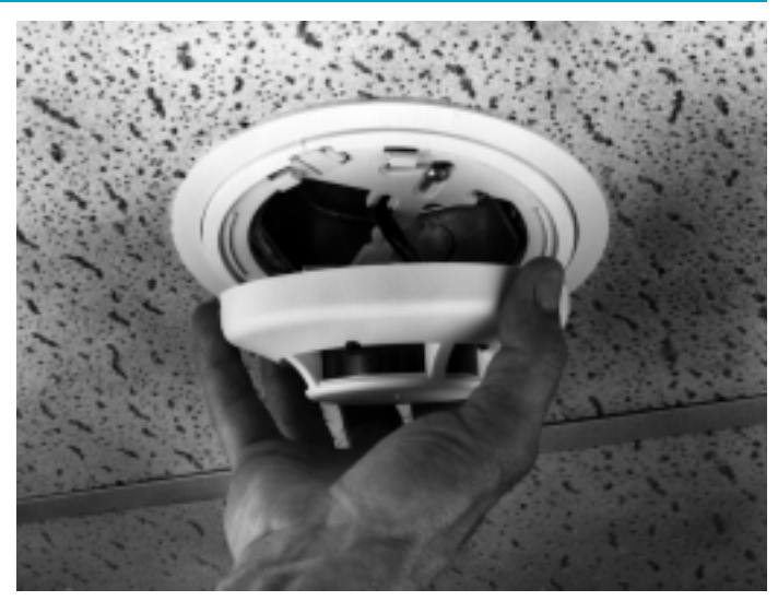
Figure 2. Install detector.