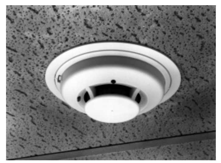
Figure 3. Adapter bracket covers previous detector footprints and flawed installations.