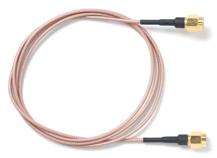
Model 4846-UU SMA Plug to SMA Plug, RG178B/U