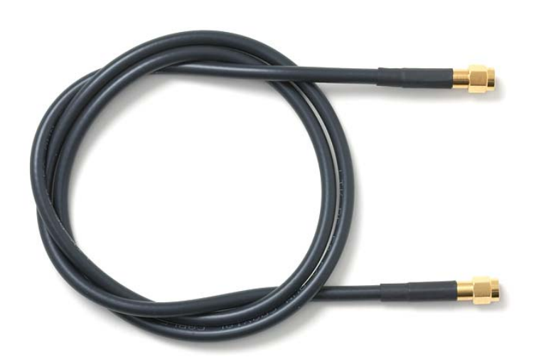
Model 4846-C SMA Plug to SMA Plug, RG58C/U