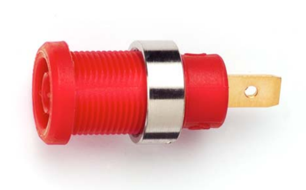
Model 72913 Panel Mount IEC61010 4mm (0.16in) Jack for Sheathed Banana Plugs

Panel Mt IEC61010 4mm (0.16in) Jack for Sheathed Banana Plugs